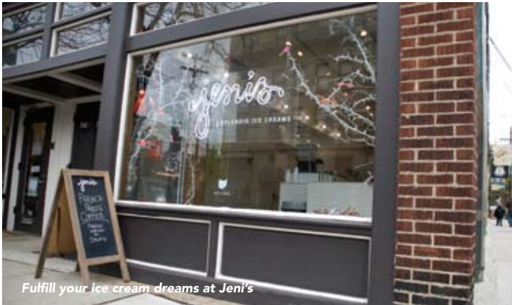
Fulfill your ice cream dreams at Jeni's