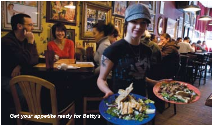
Get your appetite ready for Betty's