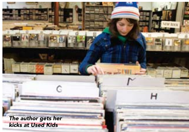
The author gets her kicks at Used Kids