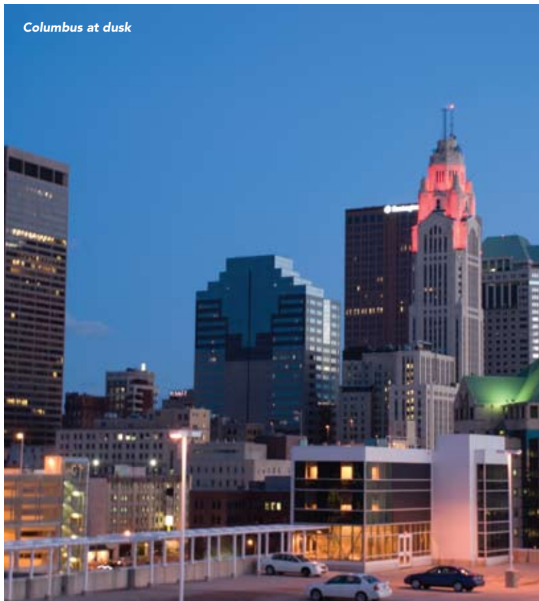
Columbus at dusk