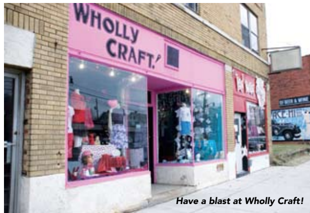
Have a blast at Wholly Craft!