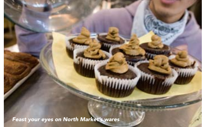
Feast your eyes on North Market's wares